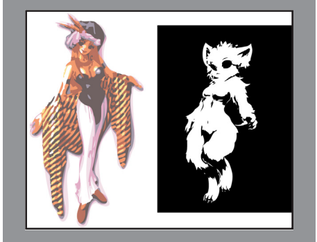
Bigieu - Bigieu initially has high level access to Genova Biotech intel while under employment there. A whistleblower who tries to warn people about Genova Biotech and provides some help during

Hargreave - Very wealthy, entrepreneurial and close to the government. Provides major private funding to Koshi at crucial points through the story.