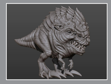
A/Generation - An early stage bio-weapon developed by Genova Biotech.