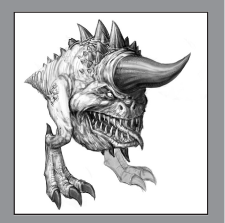
B/Generation - A late stage

bio-weapon developed by Genova Biotech. Genetic similarities to A/ Generation.