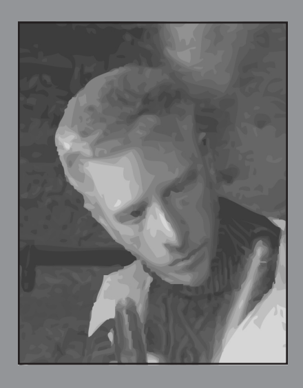
Mike The Cowboy - A Russian ex-con who assists with the Black Mesa and Tropics assault after befriending Koshi.

the story. As a result of an experiment at Black Mesa, can morph into a cat. (Last reference: Felicia of Darkstalkers)