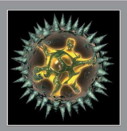
Parasite - Byproduct of Genova Biotech research; first appears from Nu.